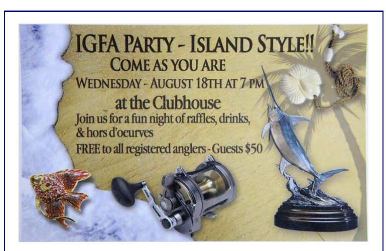
This party is for all Tournament participants!! Join us!!