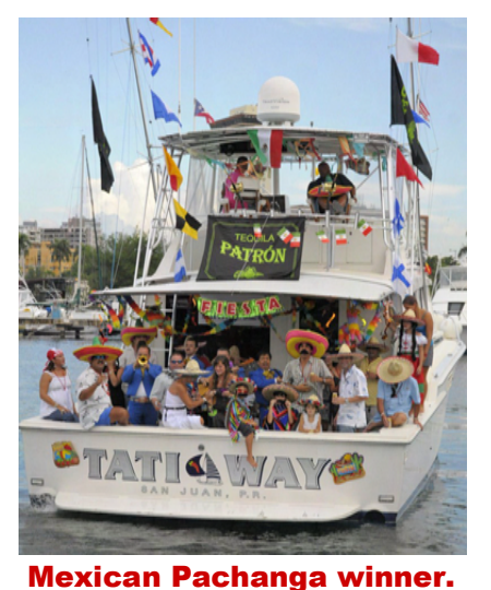
Tati Way with its Mexican nacho-and-chip style and so many people in the cockpit...