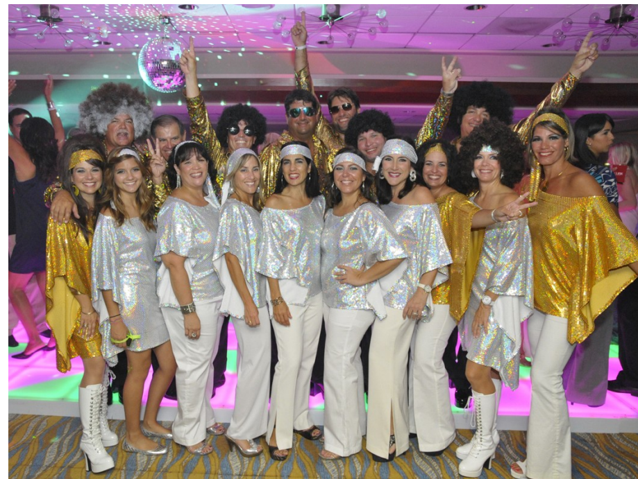
International Marlin Dancers