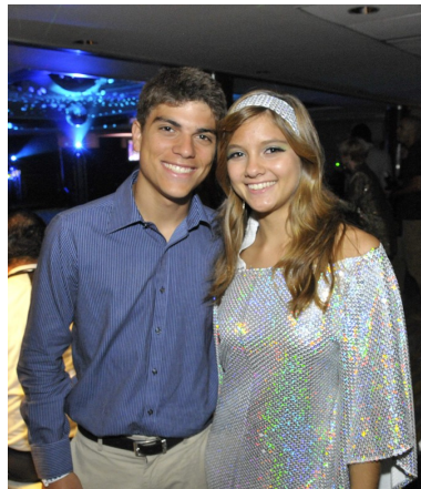
Superb Team of Cousins